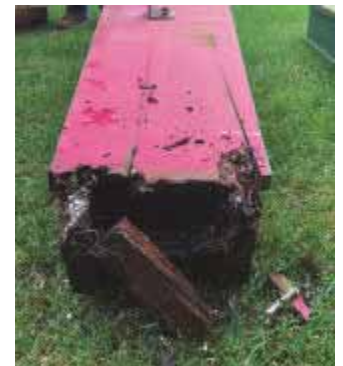
Rotten boards where the cross broke and fell to the ground.