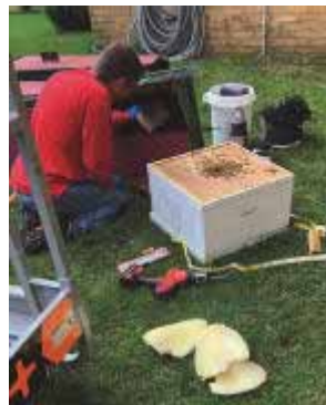
Bee farmer saving about 20,000 bees from the cross on the outside of our building.

There are many people who are not returning to Mass yet because of the continued threat of the health pandemic, especially those who are part of our vulnerable population. I am working with the Diocese on offering Holy Communion outside of Mass so people can come to Church and receive Communion without remaining in Church. I have been told this can only be offered to those who have health concerns and are vulnerable. Please stay tuned for more information on this. If you would like to receive Holy Communion and are not comfortable coming to Mass, please contact the parish office and we will arrange this with you.