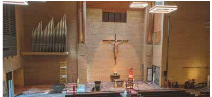
Above: Church 2 weeks ago; Below: Church last Tuesday

It is quite amazing to watch all the moving pieces of the project come together! Thanks to all of you for your patience! We are all looking forward to the day when we can utilize and celebrate in our newly updated space and pray together. Blessings! Greg